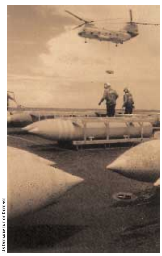
Pallets of bombs delivered to the carrier John F. Kennedy.

Hierarchical government is in quite a few respects losing effectiveness and credence. What needs to emerge, and may be starting to emerge, is networked