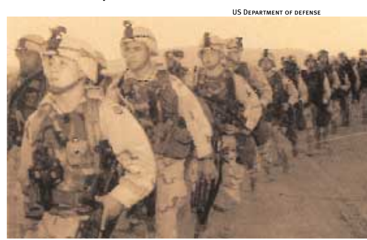
Soldiers from the 82nd Airborne arriving in Afghanistan.

Helping others live decent lives is a worthy mission that our nation has